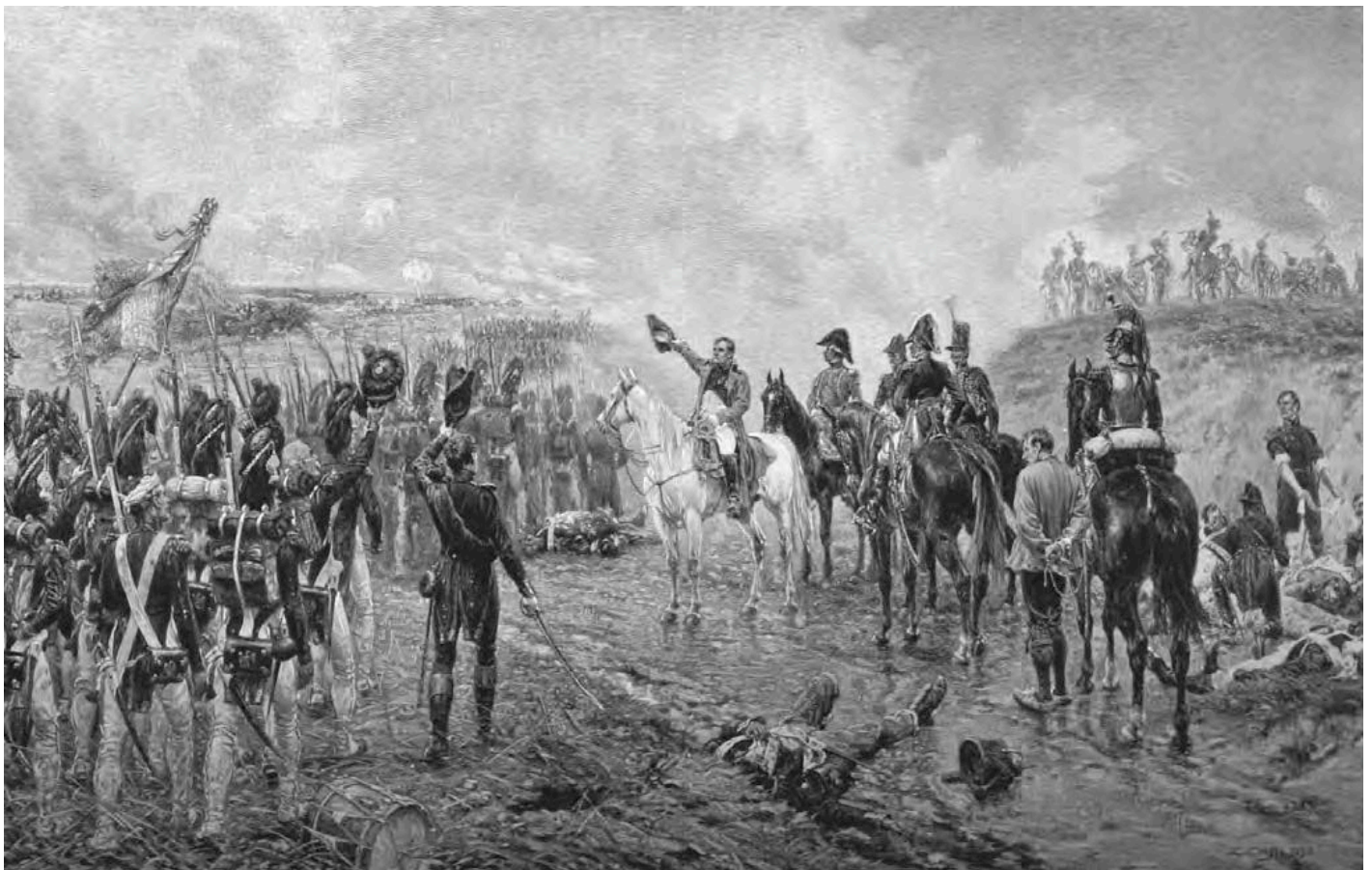
Napoleon addresses the Old Guard, elite veterans of the Imperial Guard who had served Napoleon since his earliest campaigns, as it prepares to attack the Anglo-Allied centre

Once Napoleon discovered that the Prussians had not, after all, headed for home, he dispatched Marshal Grouchy with 30,000 horse and foot to ensure that the Prussians could not join with the British. This Grouchy singularly failed to do; instead of getting in between the Prussians and the Anglo-Dutch, which he could have done, he elected to attack the Prussians head on at Wavre, whereupon Blücher detailed one corps to hold Grouchy while the rest of the Prussians army headed for Waterloo.