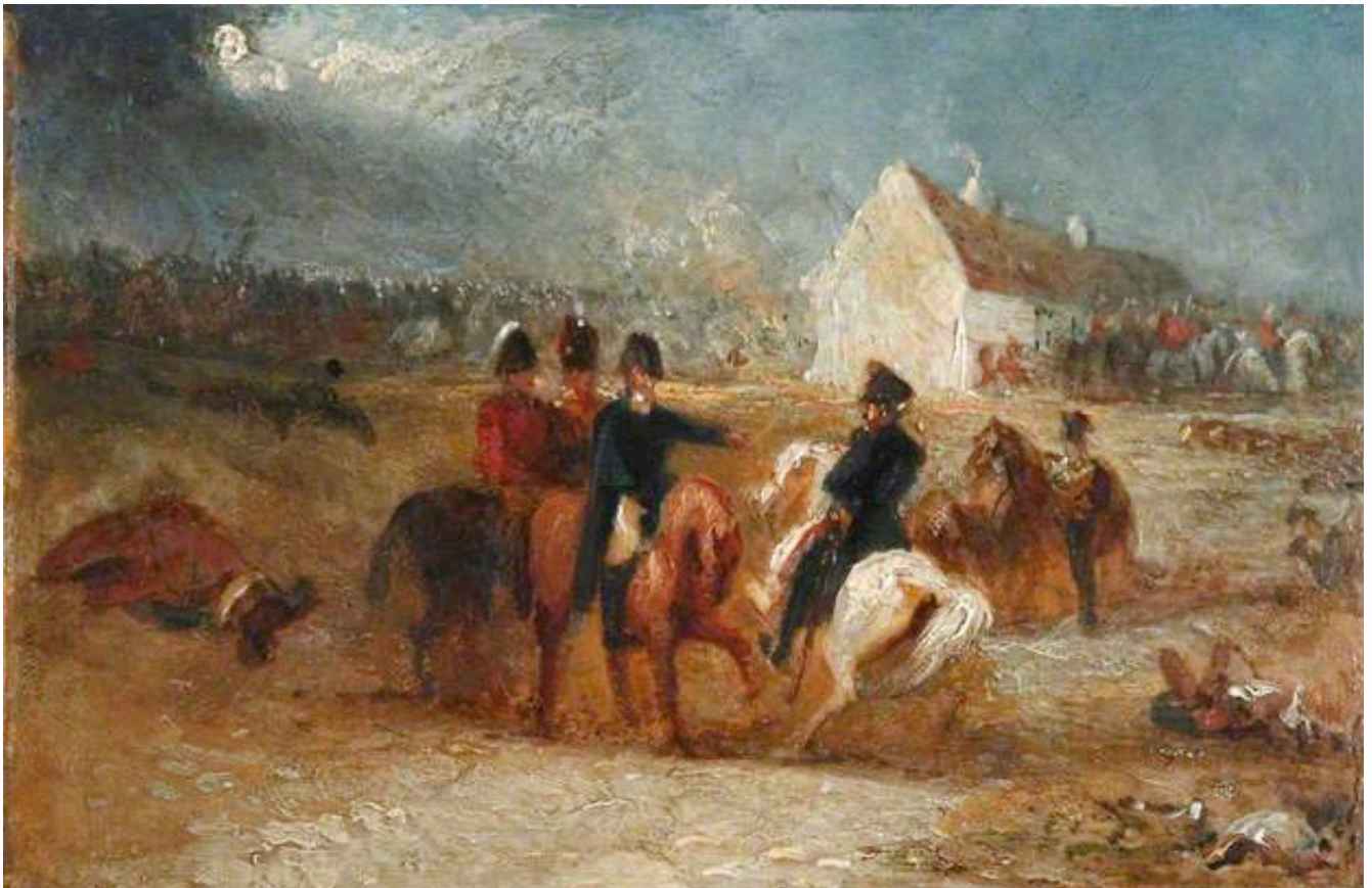
'Wellington meets Blücher at Waterloo' – a study by George Jones (1786-1869). A student at the Royal Academy, he was commissioned as a Captain in the Royal Montgomeryshire Artillery from 1812 and, although it is uncertain whether he saw service in the Peninsular War, he was with the Army of Occupation in Paris after Waterloo.