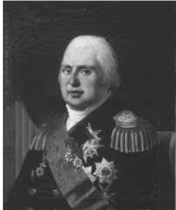
Louis XVII of France (1755 – 1824)

nobles and dispossessed landowners came flooding back, all expecting to be restored to their pre-revolutionary positions and to be compensated for their losses.