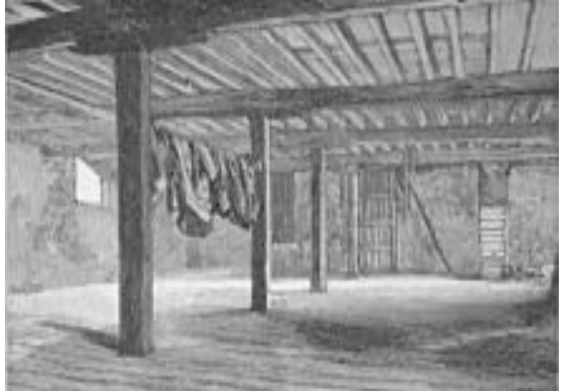
The coach house on Rue de la Blanchisserie, the next street, said to be the site of the Duchess of Richmond's Ball

'Duke,' said the Duchess of Richmond one day, 'I do not wish to pry into your secrets ... I wish to give a ball, and all I ask is, may I give my ball? If you say, "Duchess, don't give your ball", it is quite sufficient, I ask no reason.' 'Duchess, you may give your ball with the greatest safety, without fear of interruption.' Indeed, the Duke had intended to give a ball himself on 21 June, the second anniversary of the battle of Vitoria. Operations were not expected to begin before 1 July.