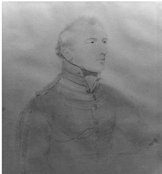
'Capt. Arthur Shakespear' - a copy of the only known portrait of him.

At Waterloo the brigade was posted on the Duke of Wellington's left flank and waited throughout the afternoon. As evening approached the 6 th Cavalry Brigade together with the 4th Cavalry Brigade, were moved, under fire, to support the hard-pressed centre of the line and, after the repulse of Napoleon's Imperial Guard, the two Brigades, about 2,600 men of six cavalry regiments, made the final charge of the day between Hougomont and La Haye Sainte, 'sweeping everything before them'.