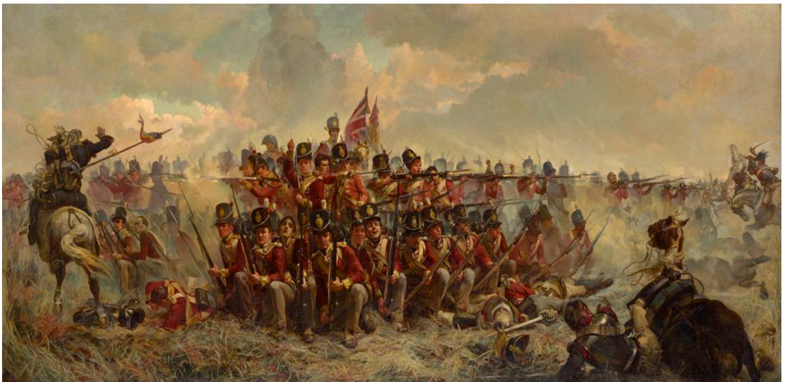
'The 28 th at Quatre Bras' by Elizabeth Southerden Thompson, Lady Butler (1846 – 1933), this famous oil painting on canvas from 1875 hangs in the National Gallery of Victoria, Melbourne, Australia

A little known picture of 'Waterloo', thought to be by one of the Drummond brothers, is the property of Bradford Museum and is on loan to the Cavalry & Guards Club, where it hangs in the Waterloo Room. It illustrates Wellington's statement that 'the day was dark - there was a great deal of rain in the air'.