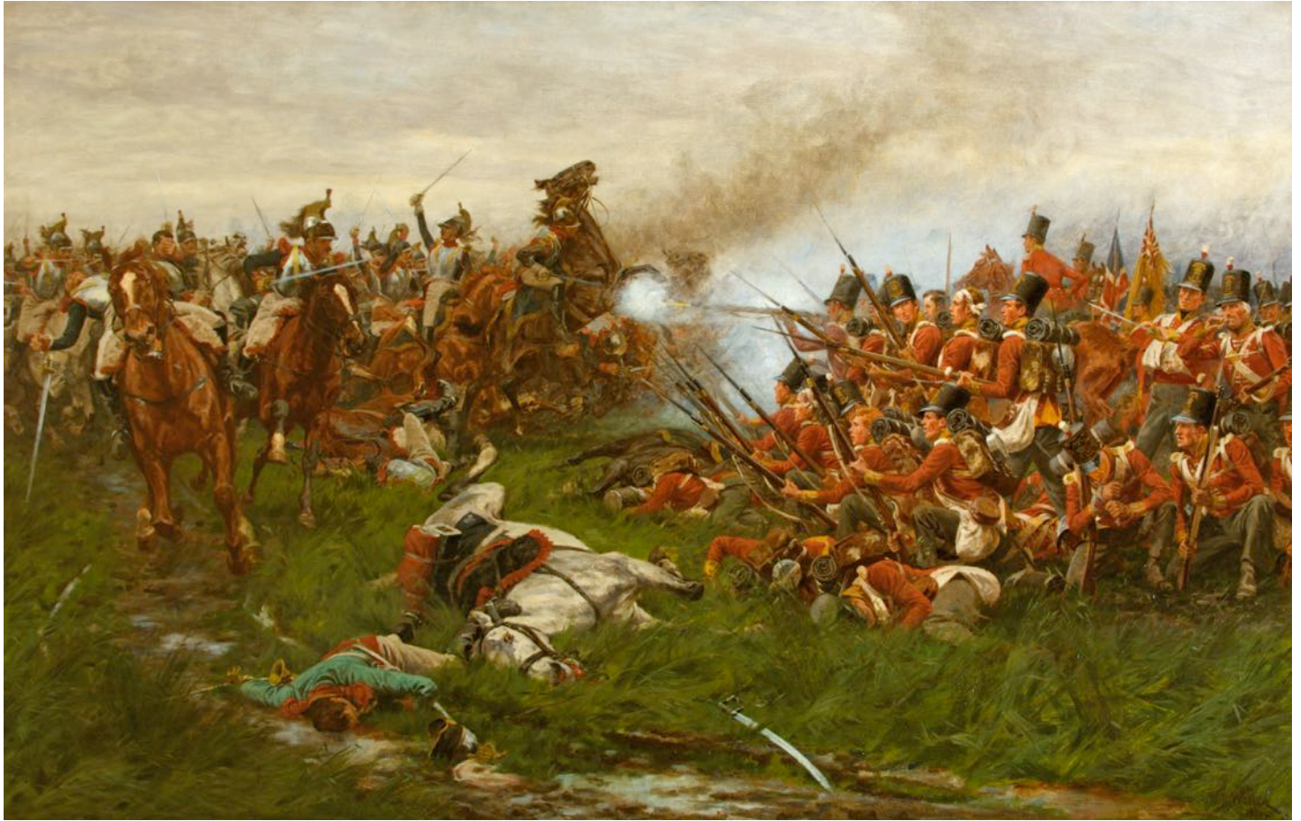
'The 28 th Regiment at Waterloo' by William Barnes Wollen (1857–1936), an oil painting which hangs in the Long Room of the Custom House.