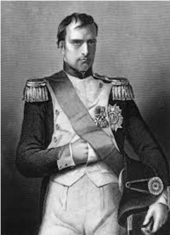
Napoleon Bonaparte (1769 – 1821)

nobles and dispossessed landowners came flooding back, all expecting to be restored to their pre-revolutionary positions and to be compensated for their losses.